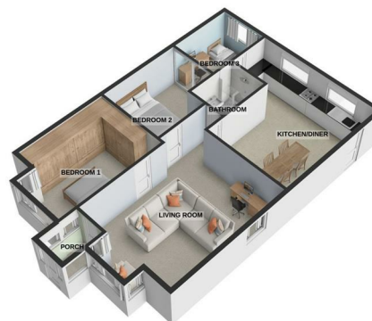
TOTAL FLOOR AREA : 943 sq.ft. (87.6 sq.m.) approx.

For illustrative purposes only. Decorative finishes, fixtures, fittings and furnishings do not represent the current state of the property. Measurements are approximate. Not to scale. Made with Metropix © 2025